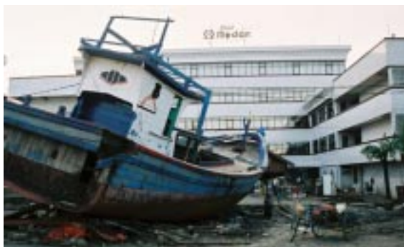
A boat on the middle of the road washed well away from the coast in Bandah Aceh, Indonesia