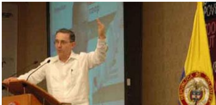
President of Colombia addressing the General Assembly of ICA in Cartagena

The representation of Youth on the ICA Board, more than just a space for participation, it is a space for young people to act inside the cooperative movement. Being here implies organizing our work, defining the motives that lead us to be here and draw the course of action to make our dreams come true.