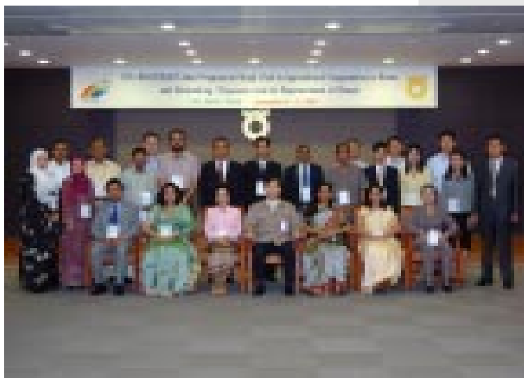
Participants of the study visit programme in Korea

The information sharing during the exposure visits to successful co-operatives, focused upon co-operative endeavour to promote women's