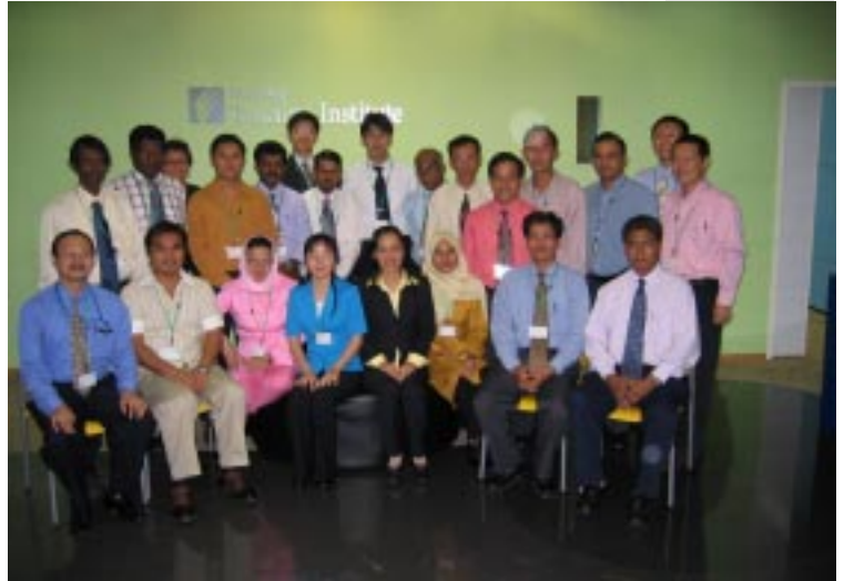
The Trainees at NTUC Fairprice Co-operative

The workshop was divided into three types of sessions; class room lectures, study visits and presentations. In the classroom session, participants learned the knowledge and skill of managing consumer co-operatives. The next day, they visited NTUC Fairprice stores and its competitors and they were exposed to the severe competition in the retail market. On the final day, they drew up action plans for their stores to overcome weaknesses and made presentations on 'What are you going to implement in your organization?'