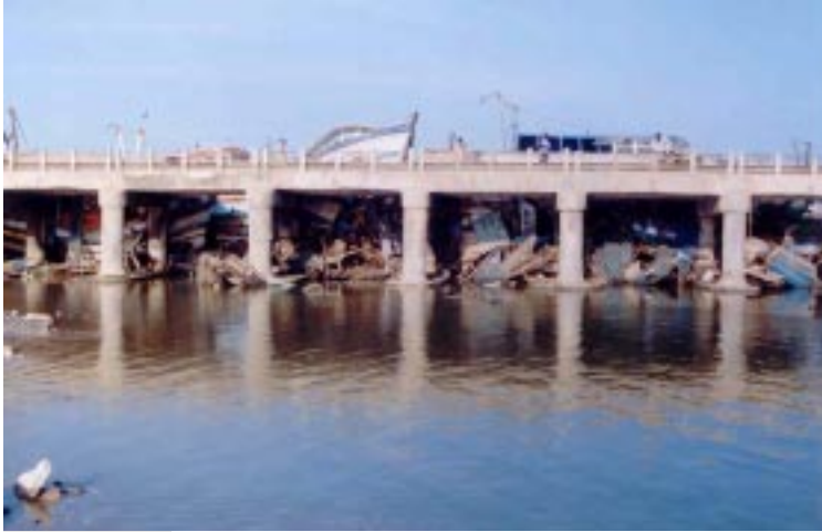
A scene in Kadaloor, Tamil Nadu, India, after the Tsunami

At this stage, however, the emergency situation has subsided, and relief efforts are geared more towards rebuilding the life of survivors by post-trauma counseling, health rehabilitation, and community redevelopment. More detailed data and information are being collected by the