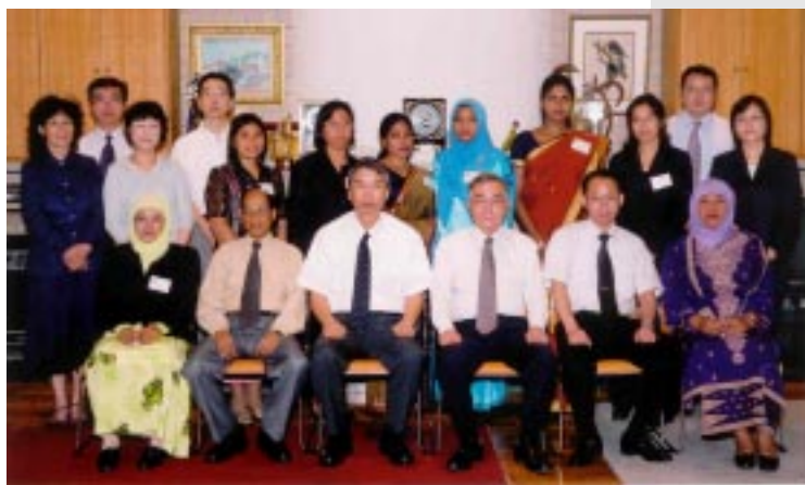
The Women leaders posed for a photo with the Japanese hosts

participants also held group discussions and prepared brief reports on the experiences gained by them. An end-of-the-Course Evaluation session was also held.