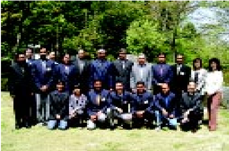
Participants of the course at a photo opp at IDACA