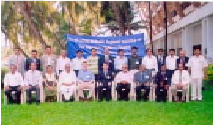
Participants at the Regional Workshop at Goa, India

An overview of co-operative credit and banking sector in majority of the developing countries of the Asia-Pacific Region shows that while credit unions have achieved appreciable success in the sphere of micro-finance, other co-operatives, by and large, appear to be perhaps the last entrants in internalizing innovative micro-finance programmes.