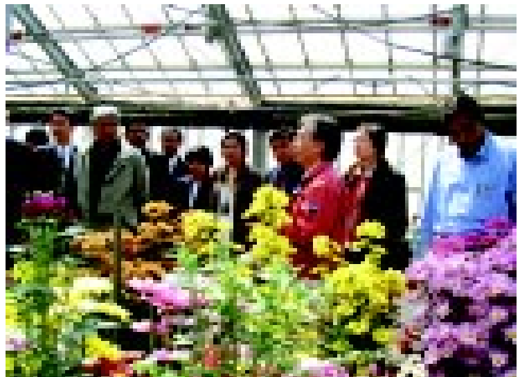
Participants visited a farmer's Green House in Japan

Certificates of Participation from the ICA as well as from the IDACA were awarded to the participants during the concluding session.