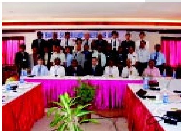
At the APHCO meeting in Tellichery, Kerala, India

Approval was granted by the General Body to admit two new members from Sri Lanka. They are (1) Colombo Co-operative Hospital, and (2) Nuwara-Eliya Multi-purpose Co-operative Society Ltd.