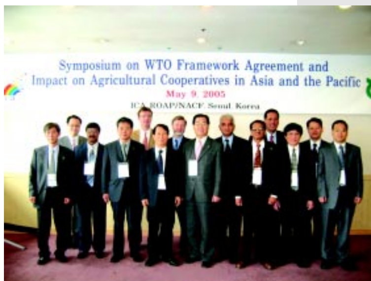
Delegates at the WTO Symposium

Both positive and negative Implications for co-operatives were discussed, like increased export