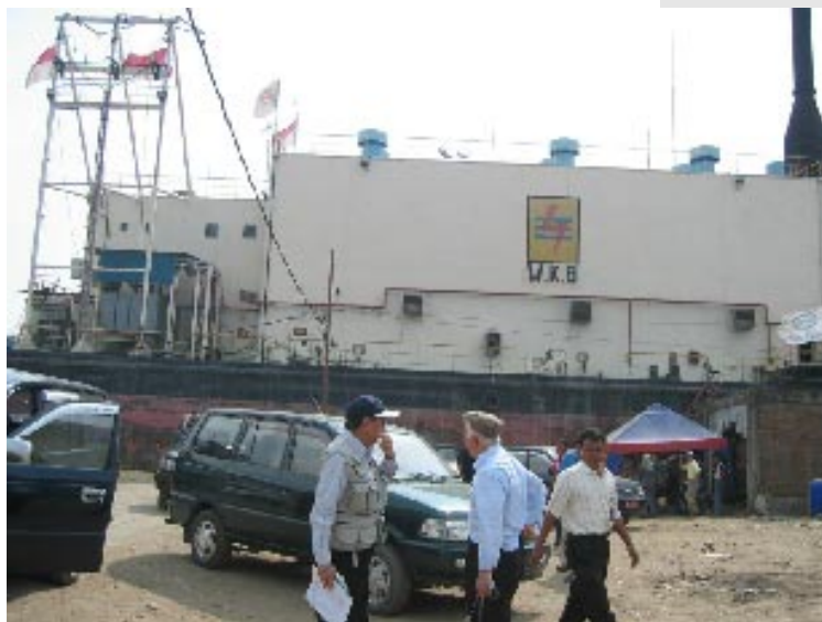
A larger ship on the road