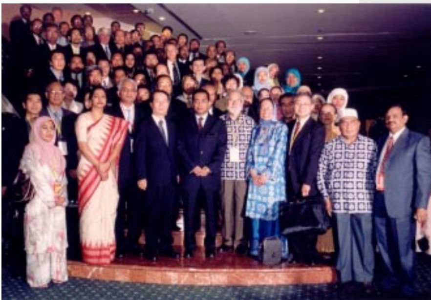
Participants of the Co-operative-Government Dialogue in Malaysia

Co-operatives belong to resource deficient segments of the society. The co-operative policy of the government must lay special stress on protection of the vulnerable target groups,