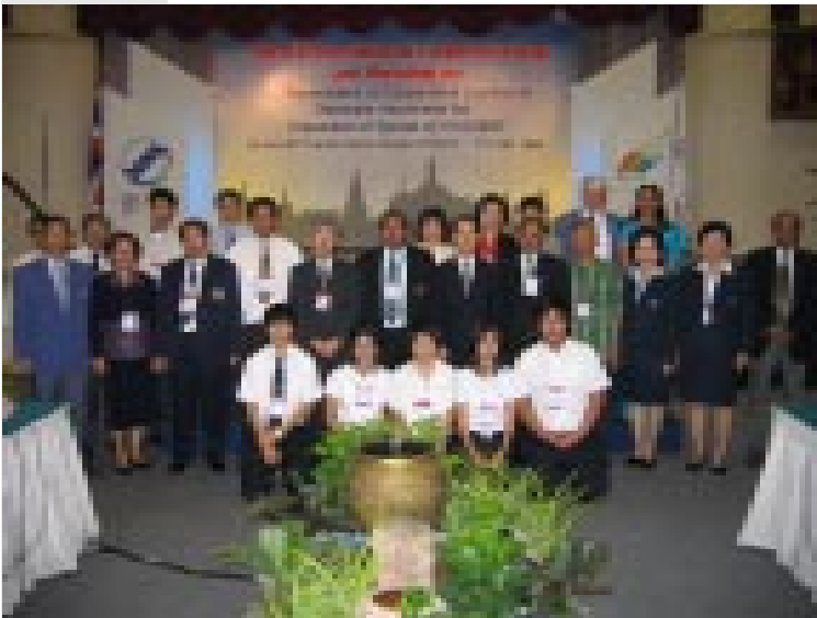
Co-operative leaders in Bangkok, Thailand at the HIV/AIDS awareness workshop

The ICA-AP has taken initiative to address the HIV/AIDS crisis in the region and a strategic project focusing on prevention and intervention activities has been put in place to cover all the member co-operatives in the region.